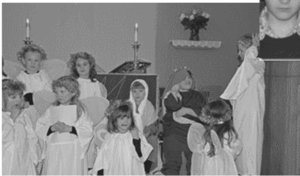
Christmas Pageant December 22, 2013