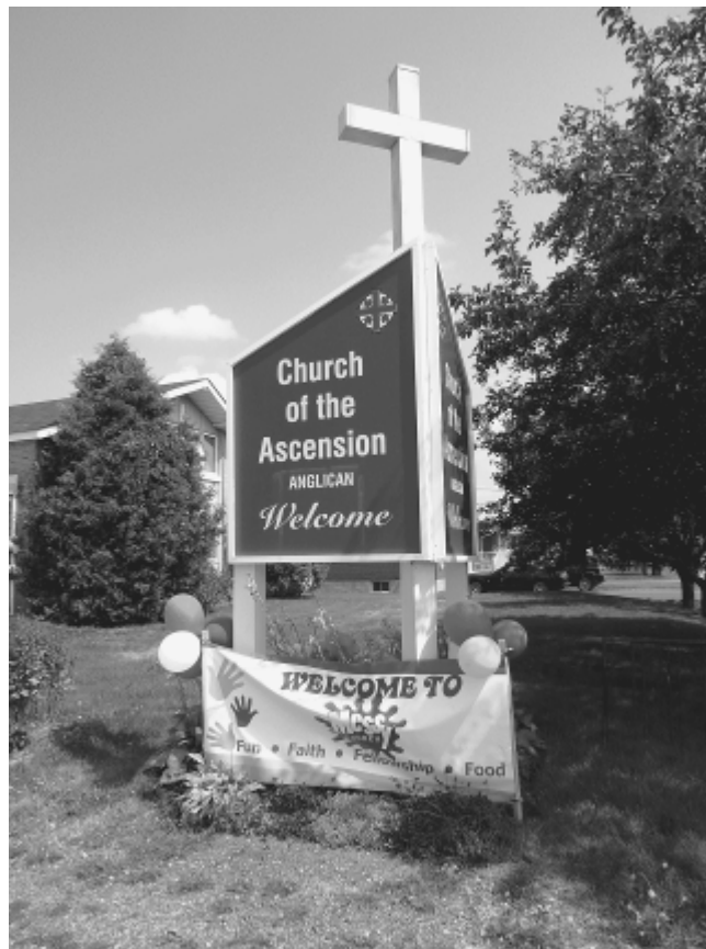
2013-08-05 Welcome signage for one of our Summer Messy Church times of Fun, Faith, Fellowship & Food. August 5th 2013