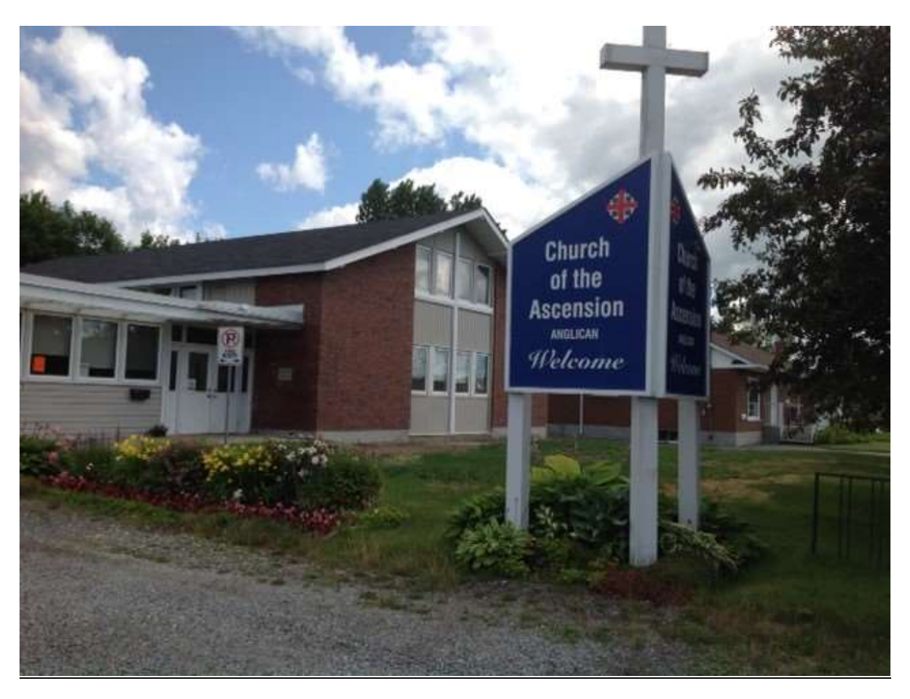
Church of the Ascension on Sparks Street

The Ascension is known for being a caring community and we still have a very active group of parishioners who make pastoral visits to those who are in nursing homes, or who are 'shut in', bereaved, or recovering from illnesses. One group of women attended the Thursday morning service at Falconbridge Extendicare for more than 50 years, ensuring that residents in the nursing home were able to get from their rooms to the hall where the services were held.