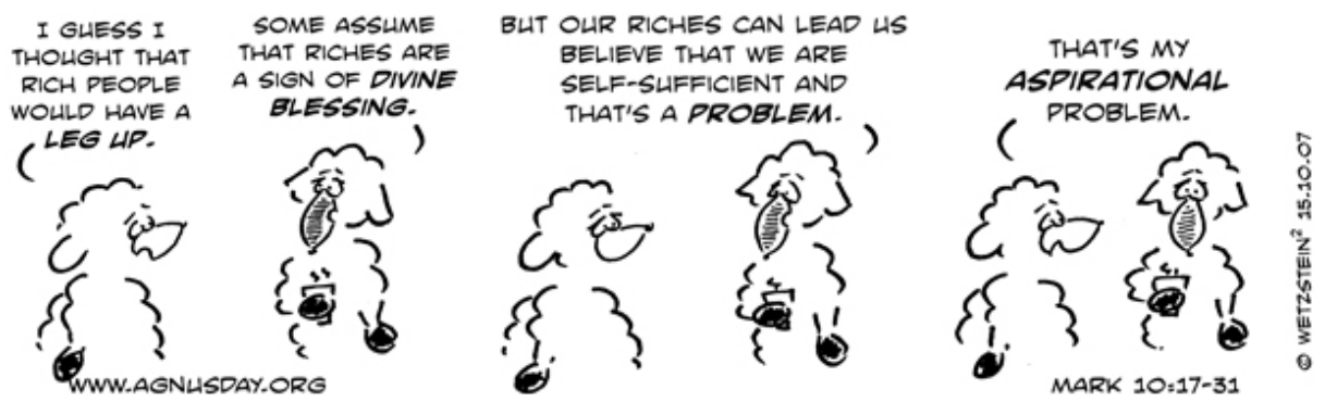
Agnus Day appears with the permission of www.agnusday.org