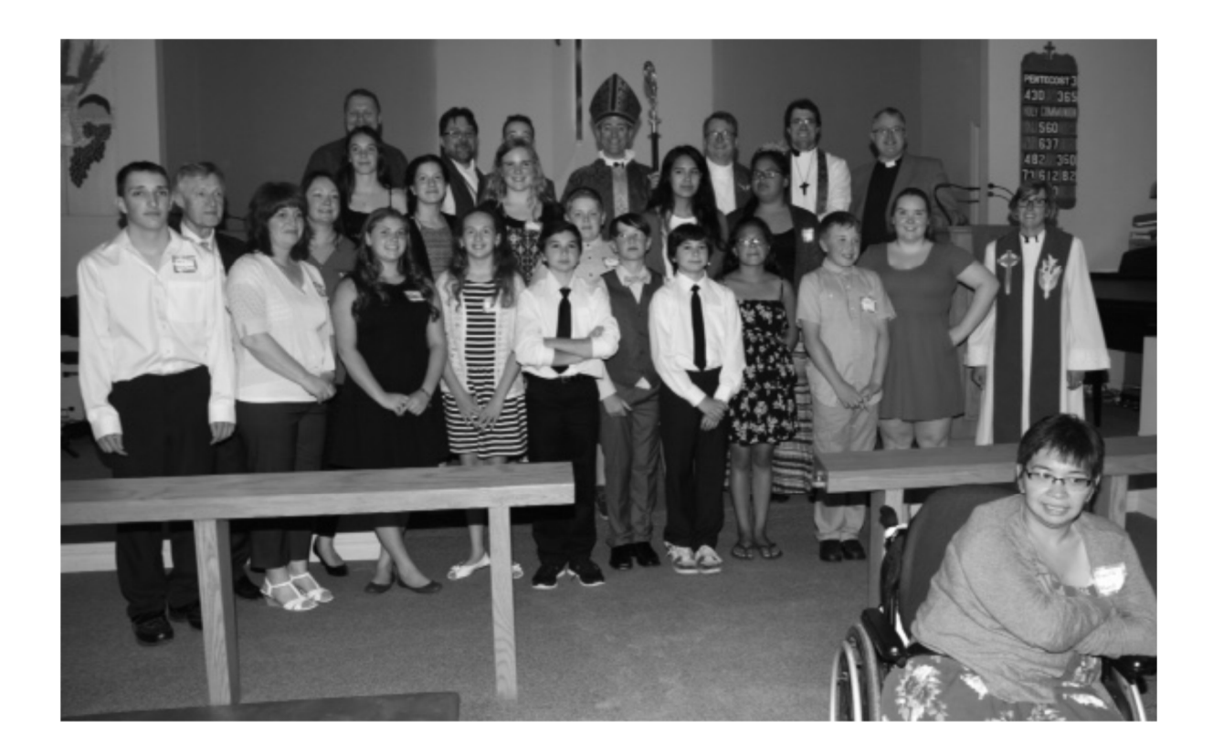
Confirmation, June 5, 2016