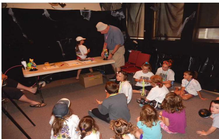
Vacation Bible School—Cave Quest

Your wardens always welcome any questions, concerns or comments you may have. We are firmly committed to the Church of the Ascension's mission, "[sharing] in the gathering work of Christ so that his newness of life overflows into our hearts, homes, churches, and community."