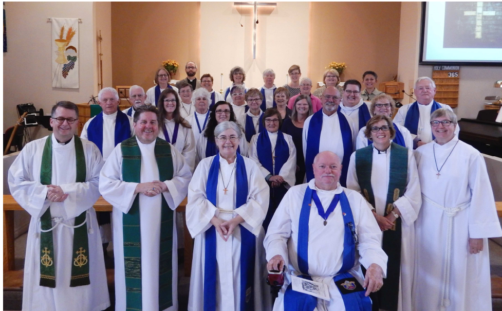
2016-10-02 - Deanery Lay Readers Conference