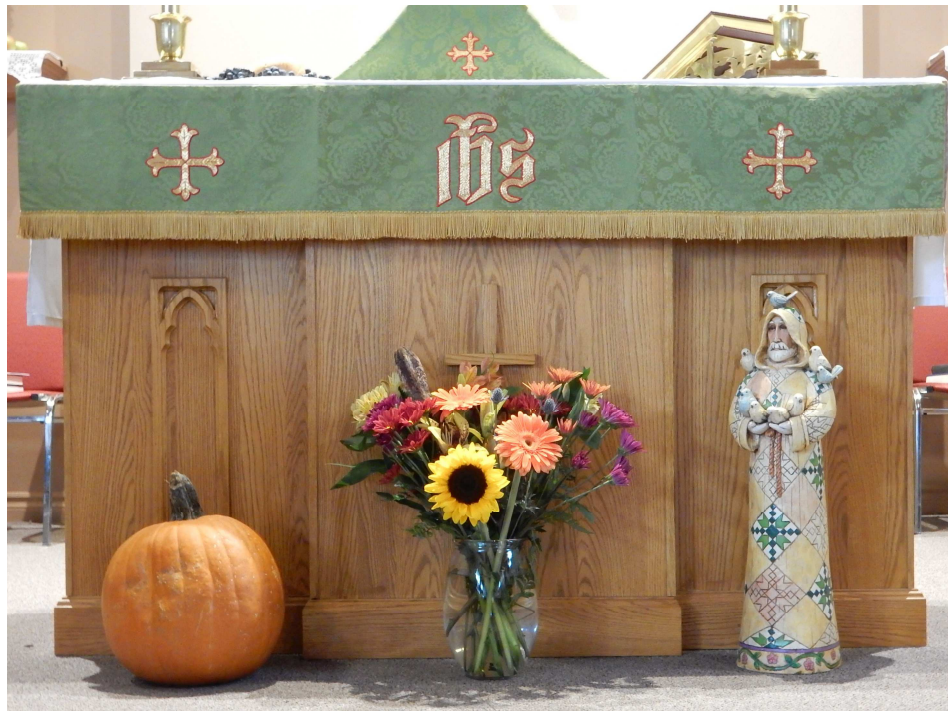
Sanctuary at Thanksgiving