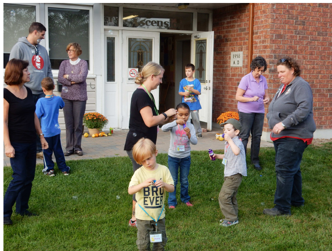
Messy Church 2016-10-05 – Theme – Bee-attitudes (Time of fun outdoors blowing bubbles!)