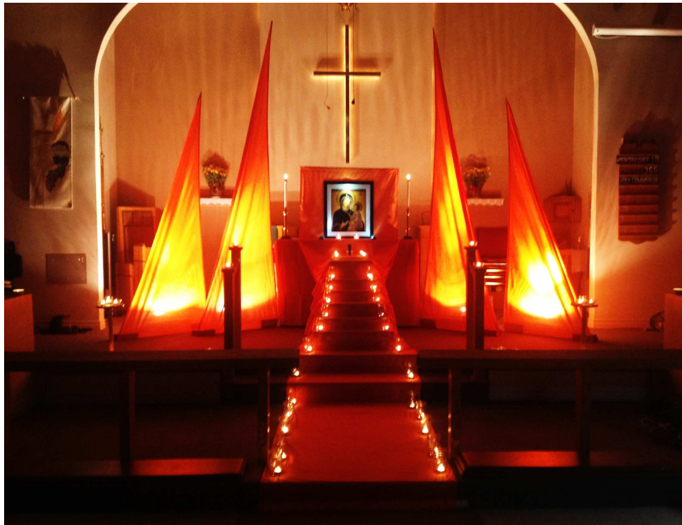
2016-09-29 – Taize Worship Service which took place on the Friday evening of the Deanery Lay Readers Conference.