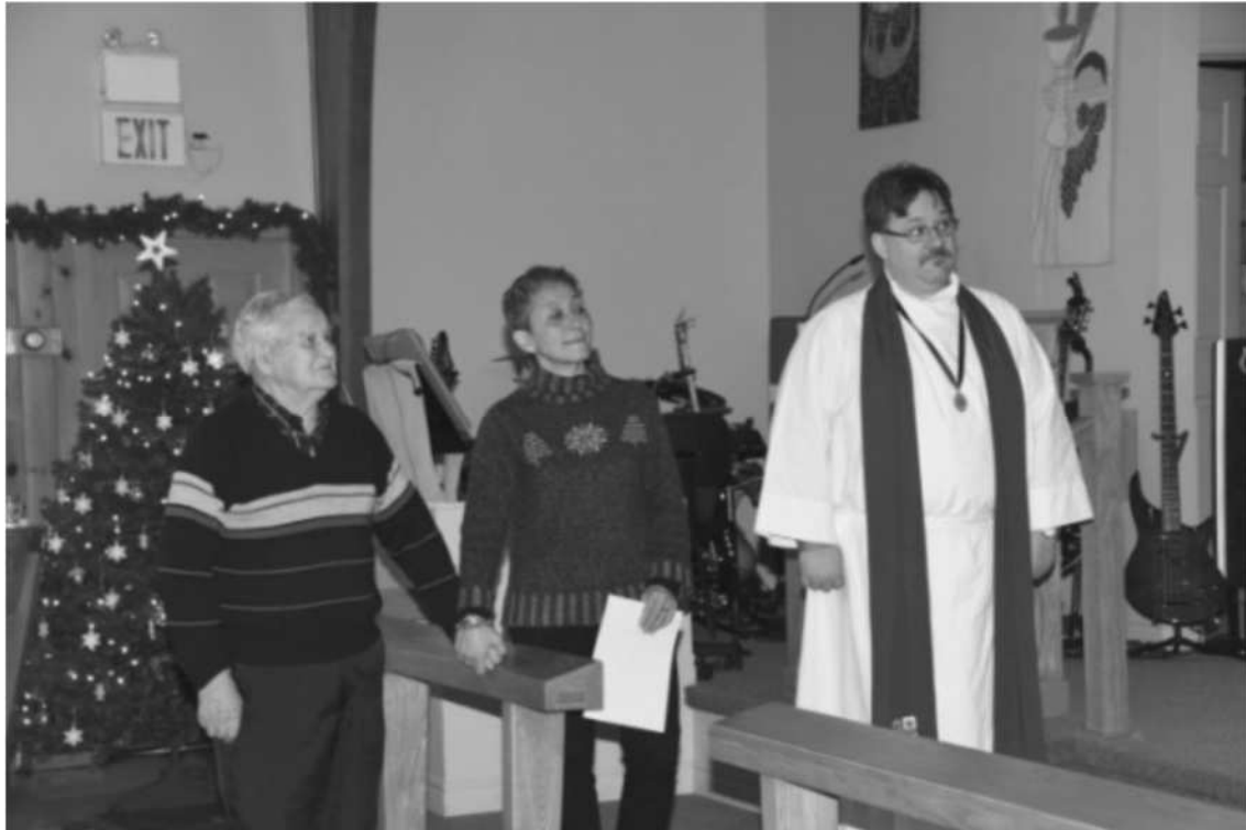
Honouring Del Gate