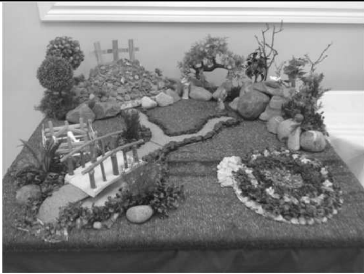
The Easter Garden by Kath Greenidge