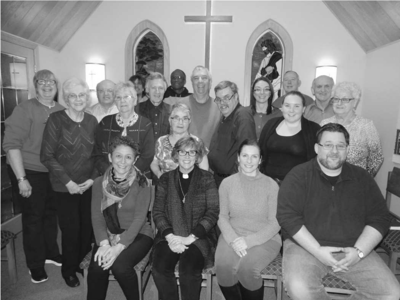
2016-02-09 - Board members for 2016.