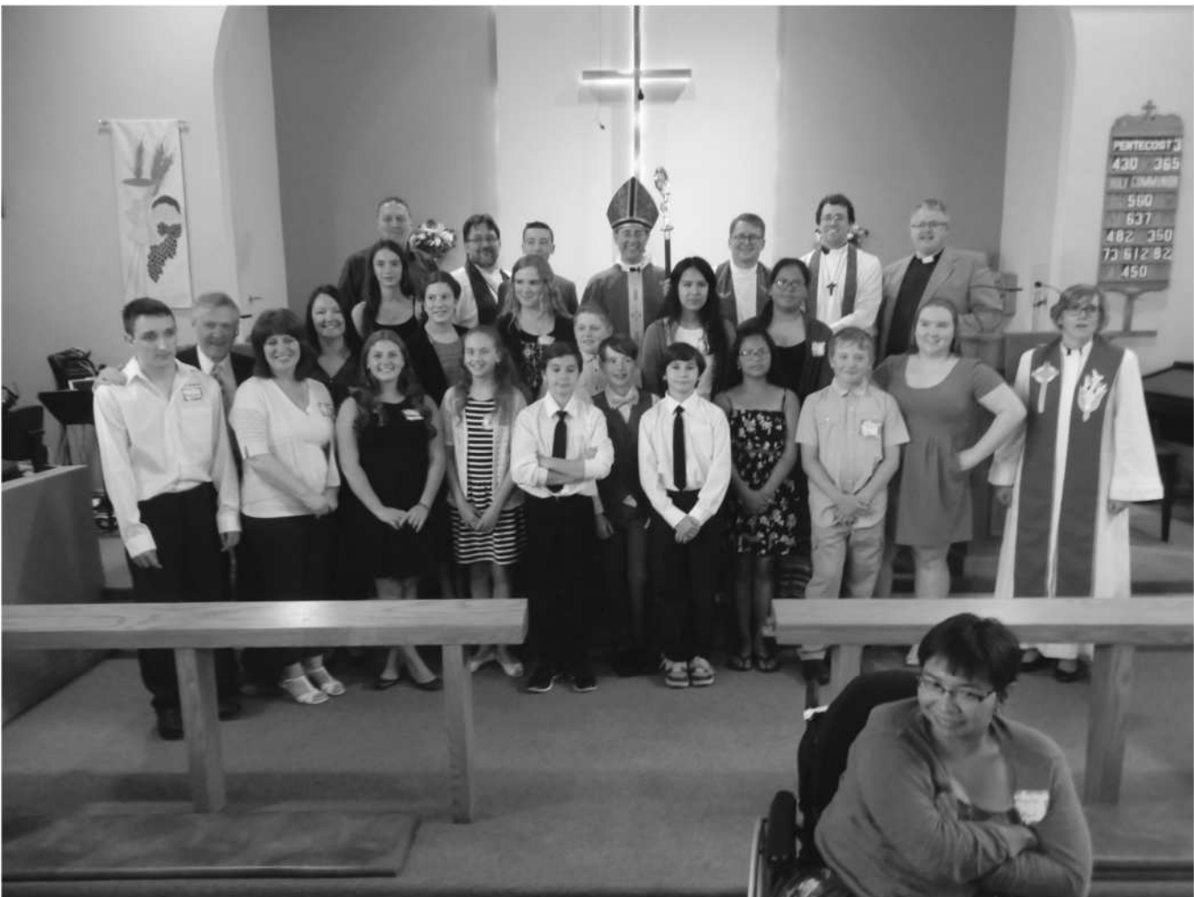
2016-06-05 - Confirmation candidates & teachers